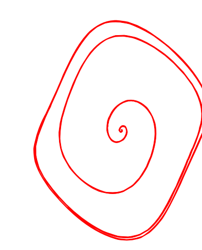
FIGURE 1: Emblem of the University of Regensburg (rotated by 30°). Emblem of the University of Regensburg (rotated by 30°).